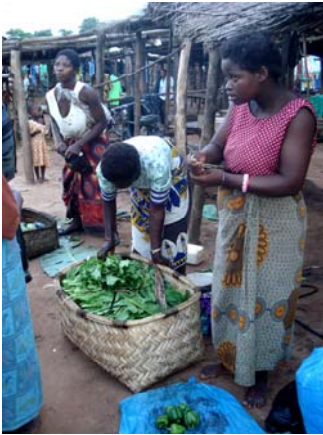
(4372) A volunteer shopping vegetables

In this way the cost of food and work is kept as low as possible, and the growing local activities results in local optimism, a better life for the villagers and a positive view at BLOOM's activities.