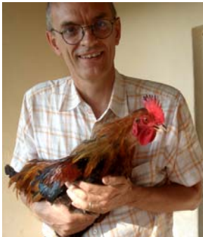
(4536_A) Present received ---