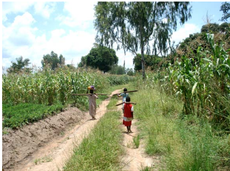
(4815) Fetching firewood

Fetching firewood is one job that is not too difficult if it is distributed on many heads or shoulders---. And the children are both willing and proud to show that they can manage a good piece of work.