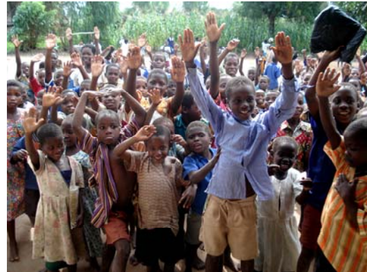
(4283) Warm welcome to mzungu (the white man)

This was my first visit to the BLOOM centre and I spent some days there. I have seen poverty and children in trouble all over the world, but to finally meet "our" children in the village was a fun and very touching experience.