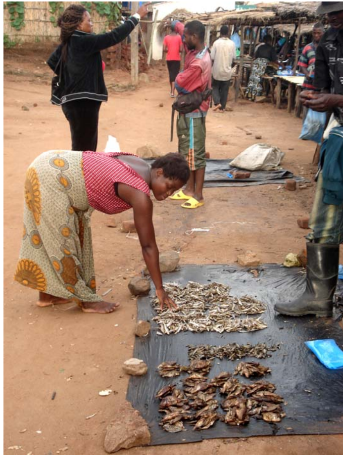
(4354) Shopping tilapia (small fish)