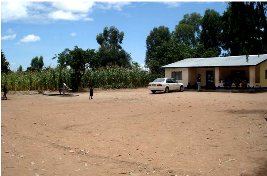
(5618_A) Bloom's house, front yard and water pump