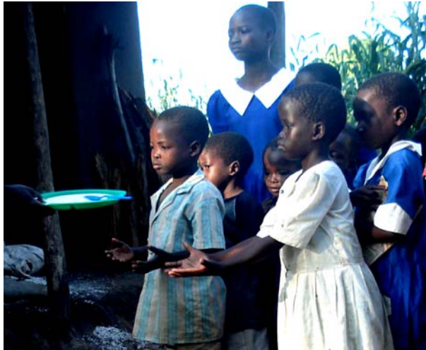
(4457_b) In line for a meal