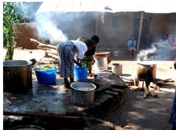
(4584) Lunch preparations. Volunteering ladies from the villages

Because the village has no electricity, the food is prepared in the traditional village way and by local ingredients like maize beans, meat, fish and vegetables from local suppliers.